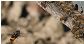
Asian hornet abdomen Native hornet abdomen