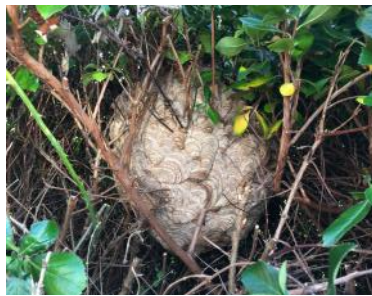
Secondary nest in a hedge